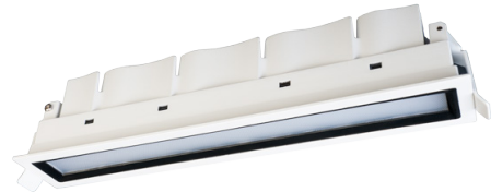
*21W model shown