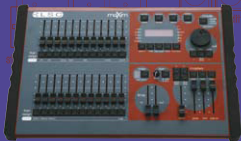
maXim S Lighting Control Console

Actual Weight: 9.0Kg (19.8lbs) Dimensions: H x W x D (mm) 115 x 500 x 340.