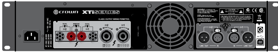
XTi 1002, 2002, 4002