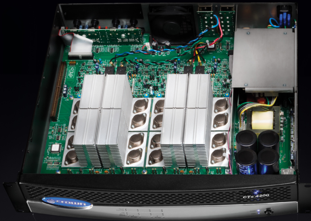
CTs 4200 | 4X250W