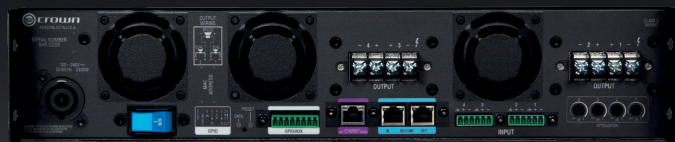
4|2400 Network Back Panel

D - Process Dante audio signals through the Soundweb London BLU-806, BLU-326, or BLU-DAN via BLU link into any DCi Network amplifier.