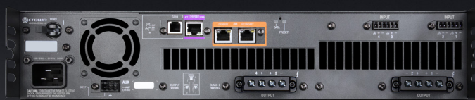
Network Display Back Panel