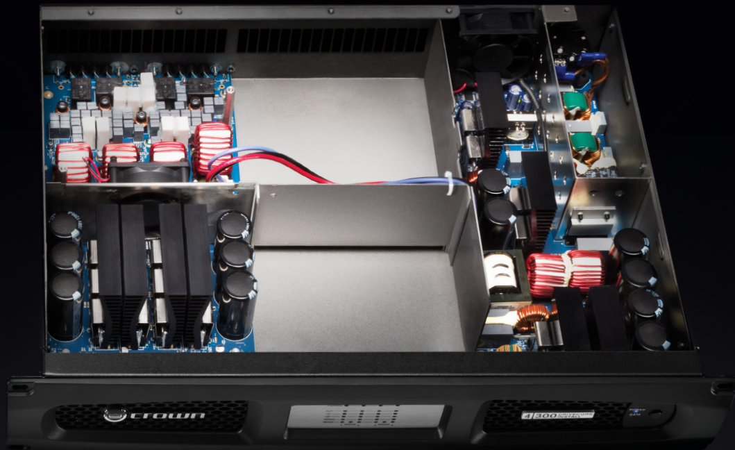
DCi 4|600 | 4X600W

A DCi 4|600 delivers more than twice the power while using just half the space of a CTs 4200 - with almost half the current draw - and drives 100Vrms lines at 600W.