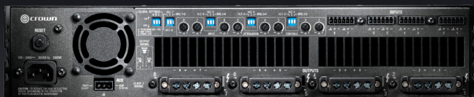
Analog Back Panel