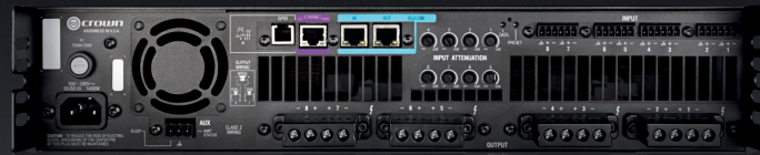
Network Back Panel